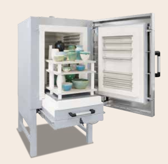
Chamber kiln NW 300 from 2024