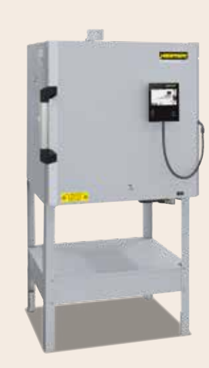
Chamber kiln N 70 E from 2021