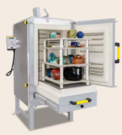
Chamber kiln NW 300 from 2012