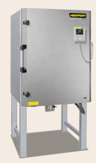
Chamber kiln N 200 from 2015