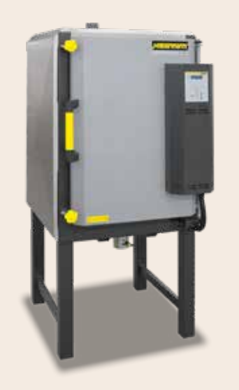
Chamber kiln N 200 from 2006