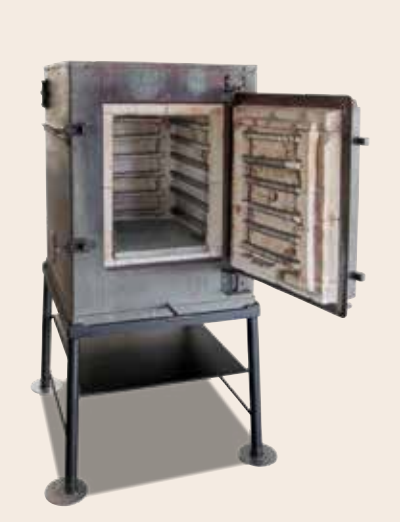
Model 14/S from 1949

Our kilns combine optimal energy efficiency and deliver excellent firing results. With the "Solar Mode" on the controller, electricity from PV systems can be utilized.