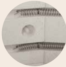
Thermocouple protected in the insulation