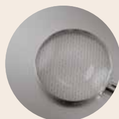
Structured stainless steel housing