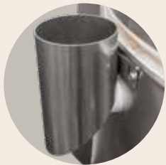
Bypass connection for an exhaust air pipe