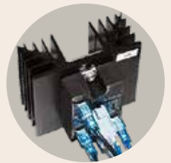
Solid state relays ensure low noise heater operation