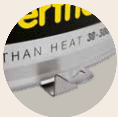
Infinitely adjustable air inlet in opening in the kiln bottom for good ventilation and short cooling times