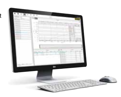
VCD Software for Control, Visualisation and Documentation