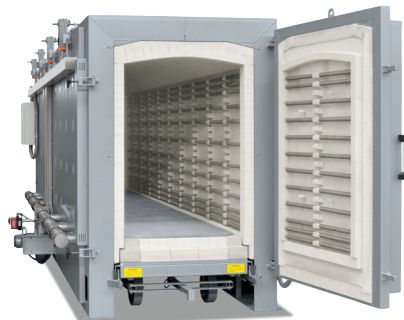
Bogie hearth furnace W 7500

Mechanical stresses also occur in the manufacture of quartz glass. In quartz glass tempering, the glass is heated to a sufficiently high temperature of 1000 °C - 1200 °C and annealed for some time to relieve stresses. Nabertherm offers many standard and customized systems for quartz glass tempering. Brick-insulated chamber furnaces (Models N ../G see page 30) are ideal for smaller components. For large, heavy components where a crane or forklift truck is required for charging, top loading furnaces (see page 50), bogie hearth furnaces (see page 52) or top hat furnaces (see page 54) are recommended. Optional powerful cooling systems or customized insulation with special fiber material with a low thermal mass enable fast cycle times.