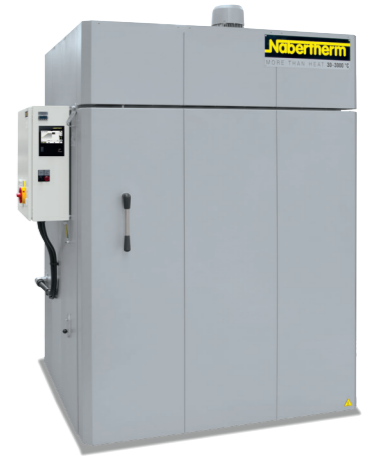
Chamber oven KTR 1500

Often a coating is applied to protect the surface of glass, to enhance the product or to give it particular properties. Typical applications include printed or painted glass, precious metal coatings or other protective coatings. With their continuous exchange of air and forced air circulation, heating cabinets (see page 10), ovens (see page 12) and chamber ovens (see page 14) are ideal for drying and curing processes up to 360 °C. For processes in which flammable solvents are released, the ovens can be equipped with the corresponding safety technology according to EN 1539. Higher temperatures are required if, in addition to drying, the coating also has to be cured. Chamber furnaces with brick insulation and radiation heating (see page 30) and forced convection furnaces for higher temperatures (see page 22) are particularly suitable for this task. The ovens can be customized to suit individual requirements, with an extensive range of additional equipment, such as a charging trolley with shelves for chamber furnaces or shelves for forced convection furnaces.