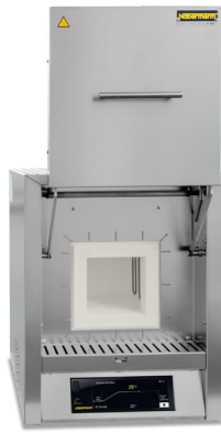
High-temperature furnace LHT 02/17