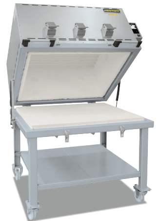
Fusing furnace GF 240

Glass fusing is a process in which different glass parts are melted together. Typical application temperatures are between 700 °C and 900 °C. Fusing unicolored or multicolored glass sheets or small crushed glass pieces (powder and granules) to form a glass sheet are just some examples. For professional glass artists, Nabertherm has fusing furnaces in various sizes and designs (see page 32). The furnaces are also available with an interchangeable table system to increase throughput in commercial applications. The tables can be exchanged before they have cooled completely. An empty table can already be charged while the other one is still in the furnace. This considerably reduces cycle times (see page 36).