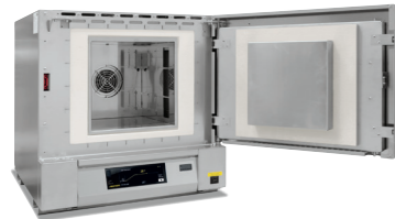
Forced convection chamber furnace NAT 30/85 as tabletop model

Forced convection furnaces are especially suitable for cooling technical glass components, fiber optics and optical components, where good temperature uniformity and temperature control is very important (see page 20). With all product lines, the furnaces can be customized with an extensive range of additional equipment to suit the customer's specific needs.