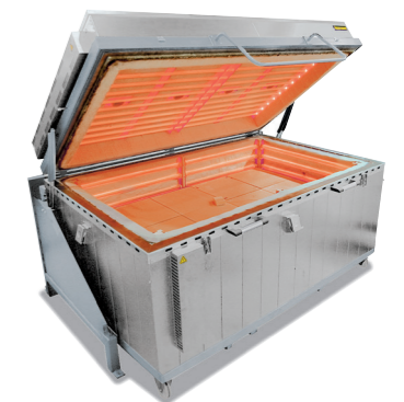
Tub furnace GW 2200

In curving and bending, sheets of glass are heated so that glass objects are created as the glass bends into the corresponding mold. Examples of this include curved display sheets, glass furniture, shower cabins, glass bowls and other glass objects. Nabertherm has tub furnace (see page 38) and top hat furnace (see page 40) solutions for curving and bending complex glass shapes. The furnaces are heated from several sides and ensure good temperature uniformity. The system is modular and can be extended with more tubs/tables to suite the customer's processes.