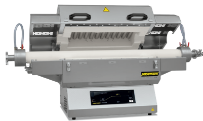
Tube furnace RSH 80/500/13 with gas tight tube and water-cooled flanges

In glass production, it is often necessary to preheat metal molds or tools so that the glass does not solidify too quickly or to keep thermal shock to an absolute minimum. Chamber furnaces with radiation heating (see page 44) or forced convection chamber furnaces (see page 22) are ideal for preheating such components. The furnaces are equipped with a lift door or parallel swing door that can be opened while the furnace is still hot. When opening, the hot side of the door swings away from the operator to ease working with the furnace.