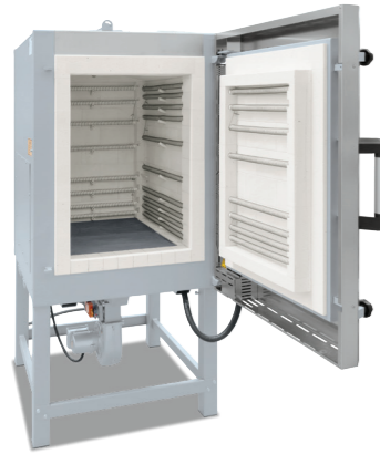
Chamber furnace N 300/G with controlled cooling