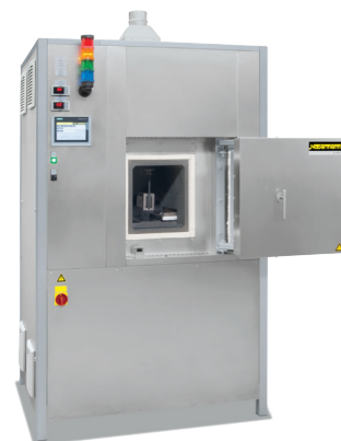
Salt-bath furnace TS 4/50

From a technical aspect, manufacturing fiber optics is a very challenging process that requires numerous heat treatment steps. Even the raw material – glass powder or granules – is generally heated in a special atmosphere to clean it. Other processes include sintering and degassing preforms. Due to the linear geometry, the flexible design for different atmospheres and the possibility to control local temperature gradients very accurately, in many cases customized tube furnaces are used in the production of fiber optics. With regard to temperature, size and interfaces to higher-level systems or sub-systems, the specifications of the furnace systems are customized to suit the customer's individual requirements. An overview of the basic tube furnaces and the extensive range of additional equipment can be found on page 78.