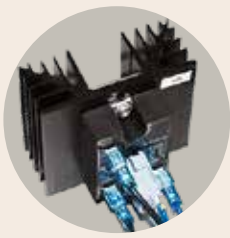
Solid state relays ensure low noise heater operation