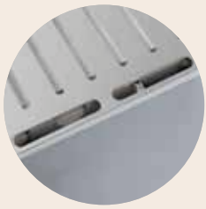
Dual shell housing provides for low temperatures