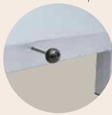
Manual air inlet sliding damper for chamber kilns up to 440 liters