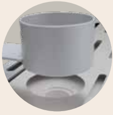
Exhaust air opening for chamber kilns up to 300 liters