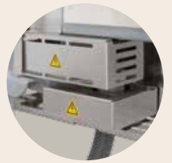
Protected door contact switch