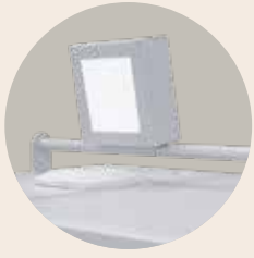
Motorized exhaust air flap for chamber kilns from 440 liters