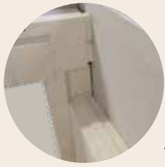
Multi-layer refractory insulation