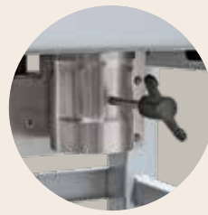
Semi-automatic air inlet flap for chamber kilns up to 300 liters