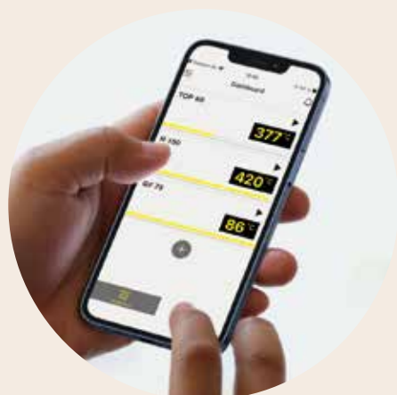
Convenient monitoring of one or more Nabertherm furnaces simultaneously