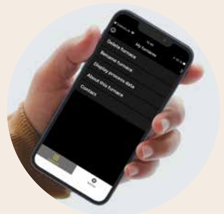
Clear context menu