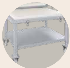
Rugged base on castors with shelf