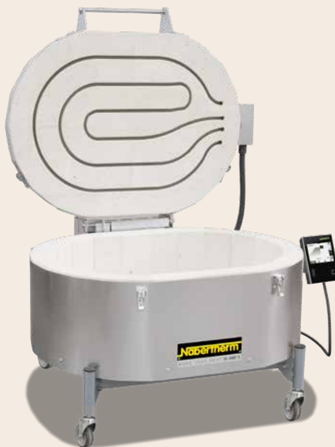
Fusing furnace F 75

A reliable companion whose performance will delight you!