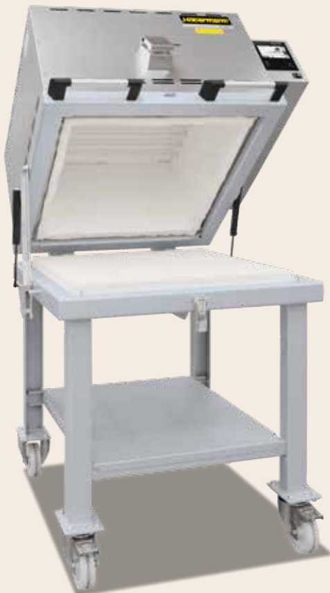
Fusing furnace GF 75

Our fusing furnaces combine precision and aesthetics. Experience how our technology enriches your artistic vision!