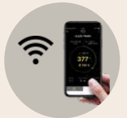
Mobile monitoring with the MyNabertherm app