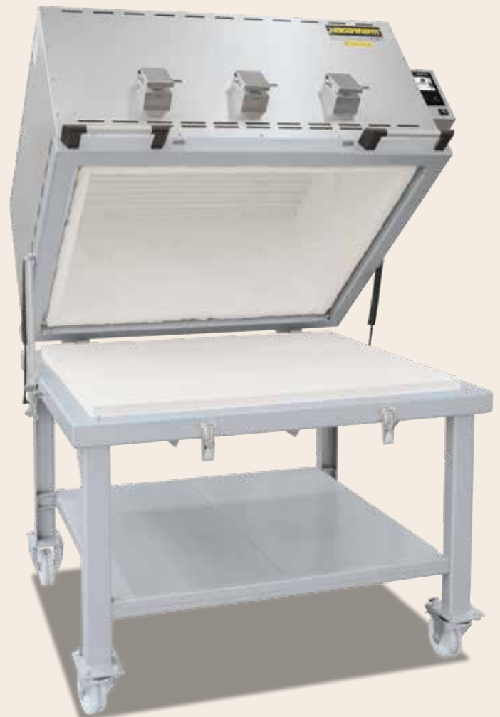
Fusing furnace GF 240