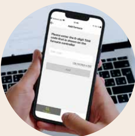
Any addition of Nabertherm furnaces