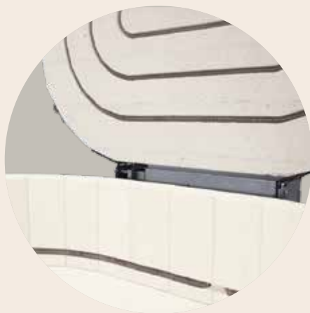
Interior with bottom side ring heating on fusing furnaces F 75 – F 220