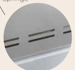
Appealing, dual-shell stainless steel housing