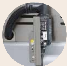
Heating switches off when the lid is opened