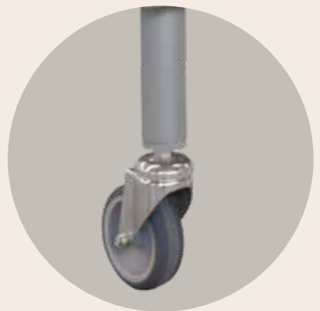
Sturdy professional-grade castors on fusing furnaces F 75 – F 220