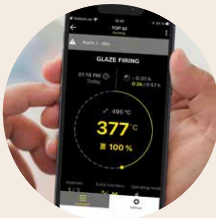
Push notifications in case of malfunctions