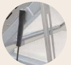
Gas pressure springs