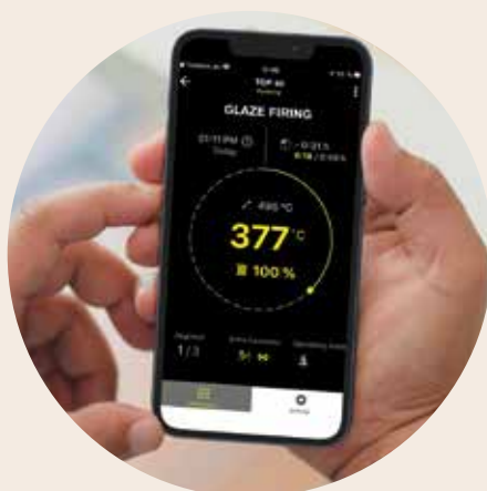
Display of program progress for each furnace