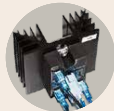
Solid state relays ensure low-noise heater operation