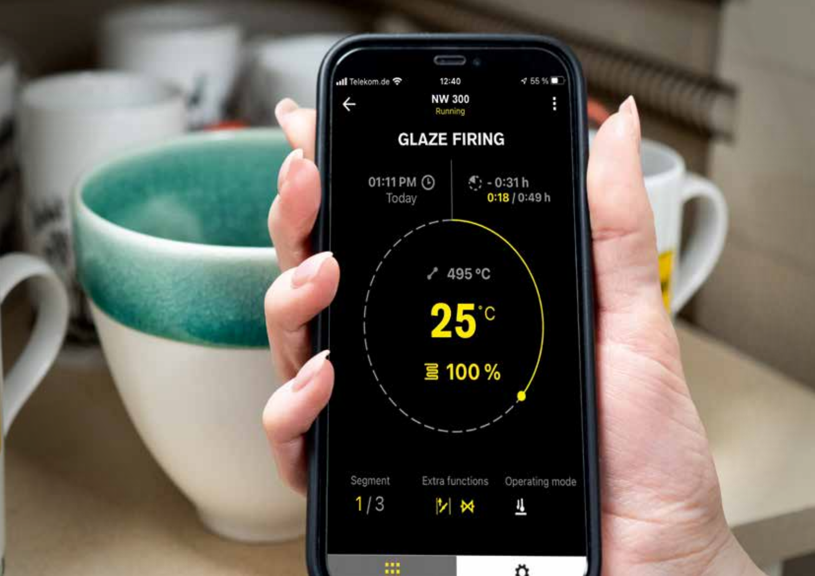
Monitoring of Nabertherm furnaces with controller series 500 with touch operation

Everything on display in the new Nabertherm app for the new controller series 500. Get the most out of your furnace with our app for iOS and Android. Don't hesitate to download it now.