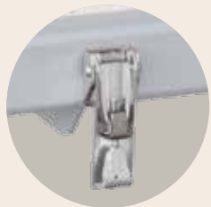
Adjustable, large quick-release fasteners