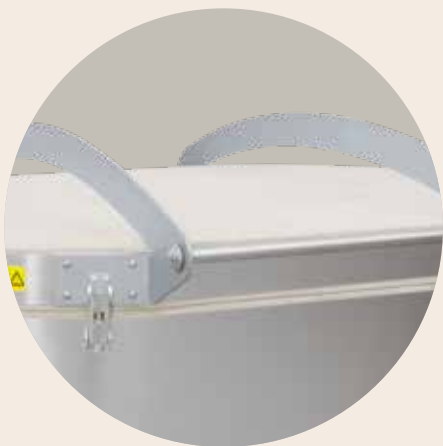
Sturdy lid design with two lid brackets