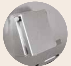
Closable opening for ventilation