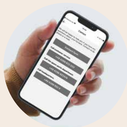
Easy to contact