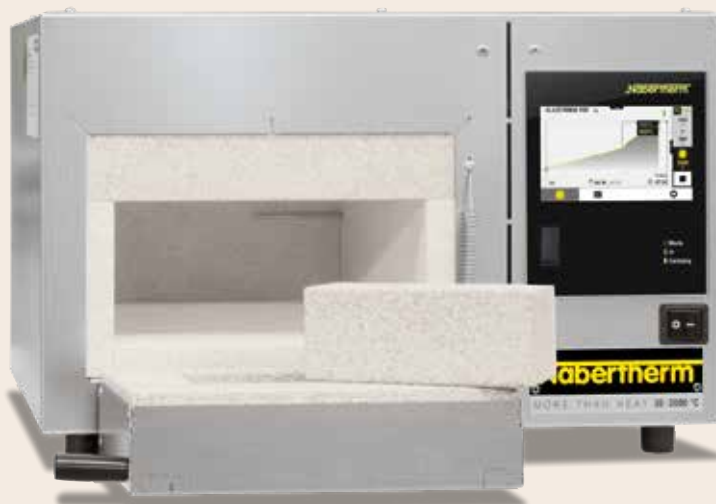
Top loader HO 70/R