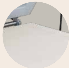
Level table surface with rugged refractory insulation