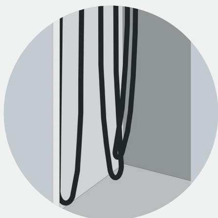
Deformations after the initial heating do not affect the function